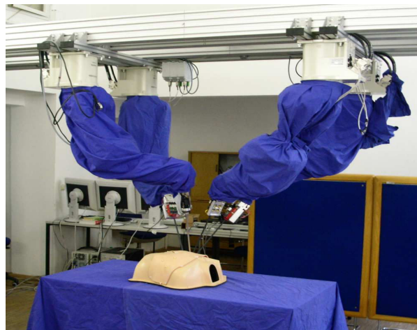
Figure 1. System setup with four robotic arms including force feedback.

System Setup. An experimental system is developed, which provides force feedback and full Cartesian control on each of the four end effectors. The system comprises four small robotic arms which are mounted on an aluminum framework (figure 1).